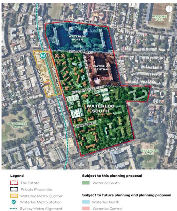
Figure 1 Waterloo Precinct

For an area that is expected to change as significantly as the Waterloo Estate, community facilities planning must consider existing, planned and proposed community facilities for the wider development precinct (ie. Including Waterloo Metro Quarter) and other sites in the surrounding area to determine future needs and provision.